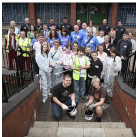
Neighbourhood Management in action in Halton.