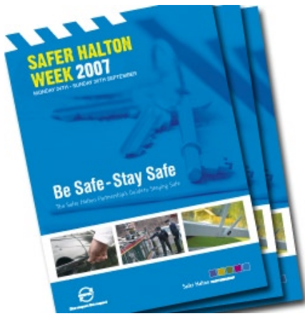
Some of the Safer Halton Week campaign material.