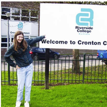
An independent traveller at her destination.