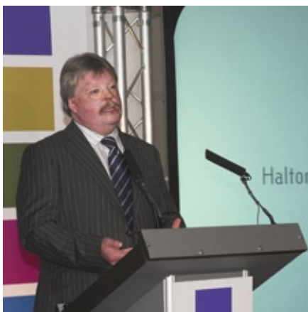
Simon Weston at last years conference.

During 2008 the updated Toolkit is being launched, providing a practical guide to the Travel Training process and an example of best practice to share with other local authorities, while the Train the Trainer Course is set to receive accreditation. If you would like to read the Independent Travel Training newsletter, click here