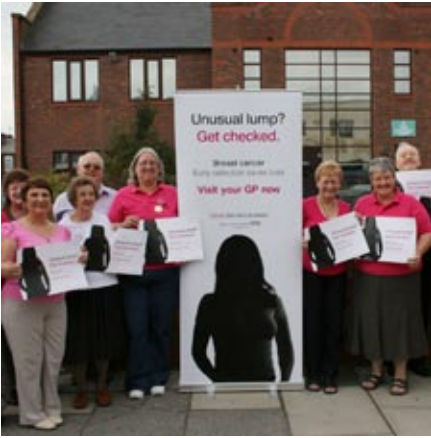
Community volunteers show support for the Get Checked Campaign.